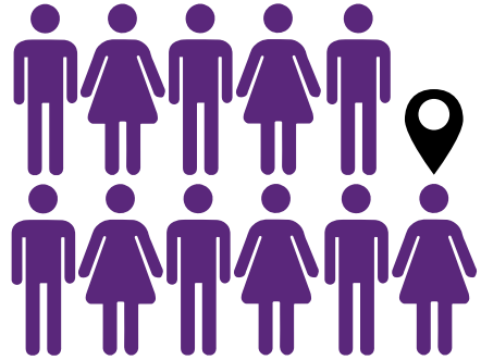
500 Course Representatives.

*Remember, it is compulsory for all Course Reps to attend Course Rep Forum and if you cannot make it you must send your apologies to huu-representation@hull.ac.uk *