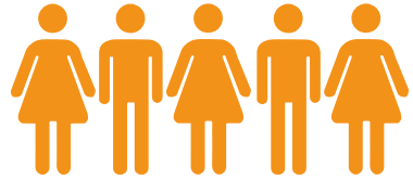
32 School Reps represent your subject group at School Learning and Teaching Committee.