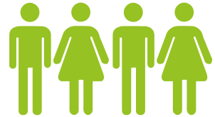
Four Faculty Representatives elected by all students in the faculty.