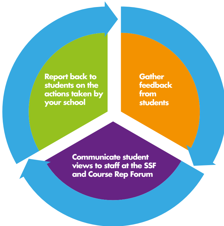
The course rep communication cycle

Course reps have a useful area on hullstudent.com to find resources or information on a certain area. This resource hub aims to support you further in your time as a course rep.